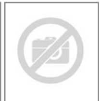
MPU-08 ext.PSU Atomic3000 P/N: 91611085