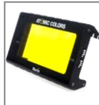
Atomic Colors for Atomic 3000 P/N: 91611086