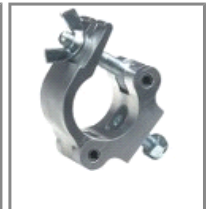
Half-coupler clamp for Ø50 P/N: 91602005