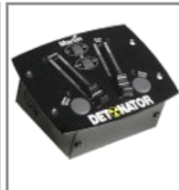
Detonator, Atomic Remote Ctrl. P/N: 90760020