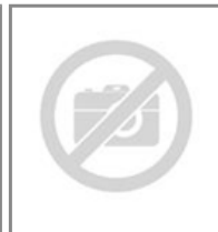
MPU-02 ext.PSU Atomic3000 P/N: 91611084