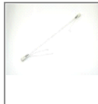
Lamp MAX-15 Strobe, Xenon, EU P/N: 97010307