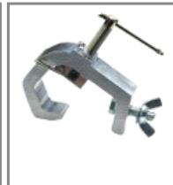
G-Clamp P/N: 91602003